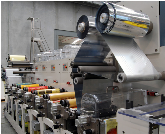
Film & sheet production

Plastic films are used for food and textiles packaging as coating substrates in extrusion coating processes, or laminated to other materials to form complex films, among others.