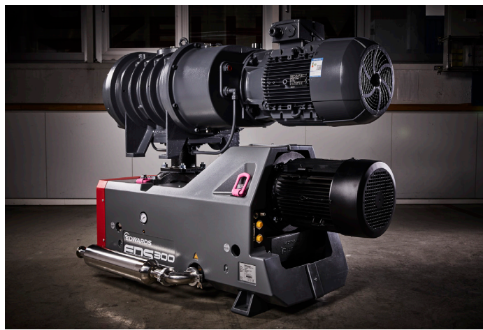
2X EDS300/EH2600, Largest Film & Sheet producer, Austria