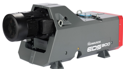
EDS - Built for challenging installations