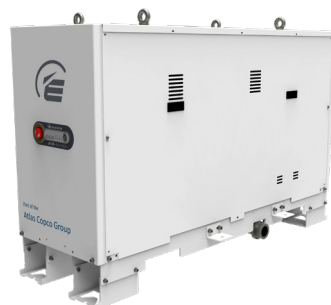
GXS - Control and automation capabilities