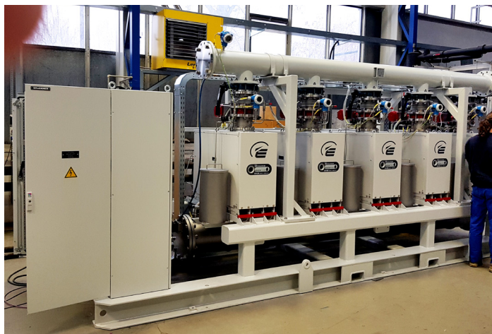
5x GXS250/2600 MD+, German Film manufacturing OEM