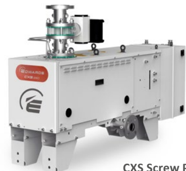
CXS Screw Pump